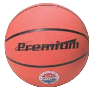
Regulation Size Basketball 060-B107 $6.50