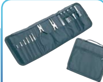
27 Piece Tool Tote 010-27PC $5.50