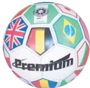
Regulation Size Soccer Ball 340-MR250 $8.95/ $13.95