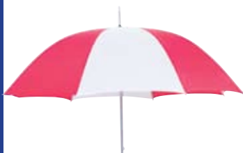
60" Golf Umbrella 060-GU30 $5.50