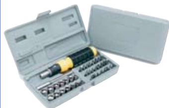
41 piece Bit & Socket Set 010-7554 $5.50