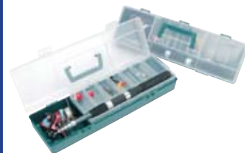
Complete Fishing Kit 060-FK $10.00