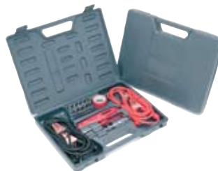
Highway Emergency Tool Kit 010-4387 $9.00