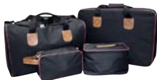
4-pc. Luggage Set 170-120 $8.50