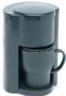
Personal Coffee Maker 150-1cup $10.00