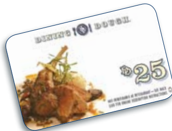
$25 Dining Dough Card 340-DINE $5.50